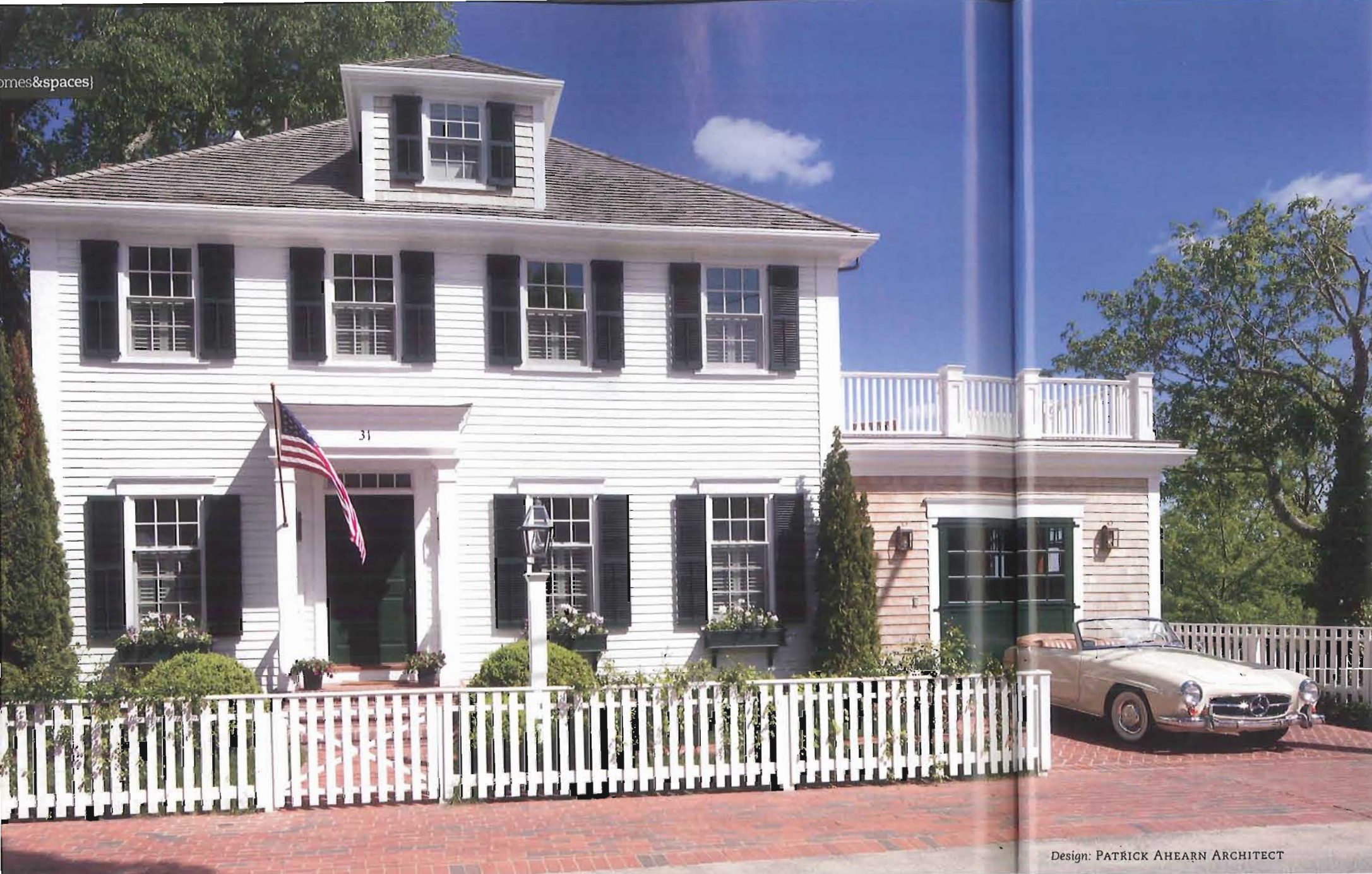
Design: PATRICK AHEARN ARCHITECT